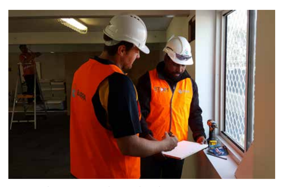
Barpa employees on site at the Mernda Rail Extension Project

'For example, we want to do full construction projects of larger scale, as they provide more opportunities for training and employment of Indigenous staff.'