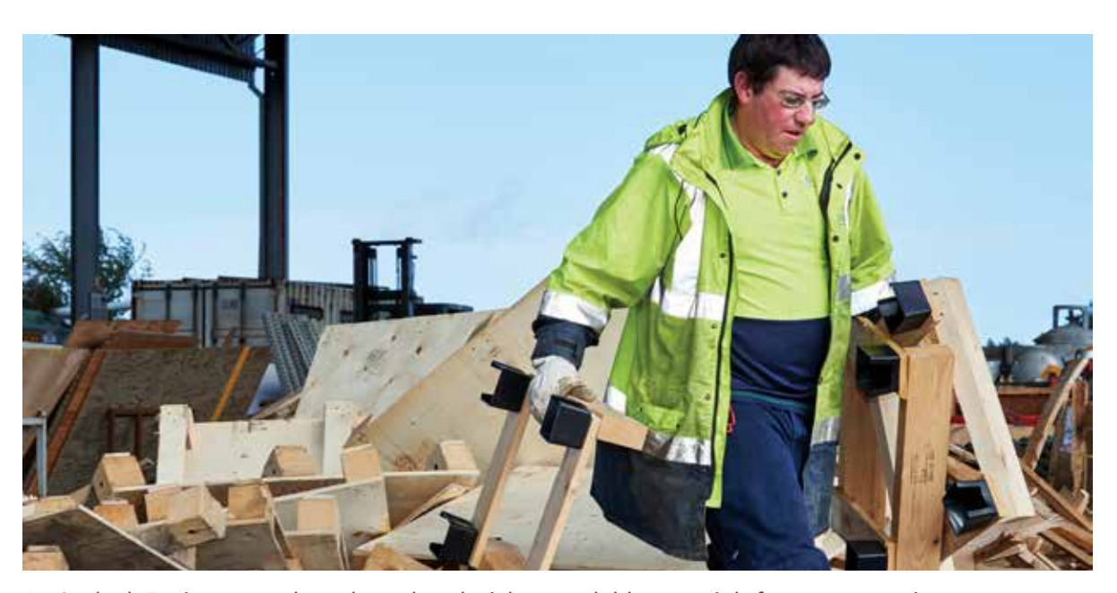
An Outlook Environmental employee hand-picks recyclable materials from construction waste

'Everyone's good at something. They've just got to find out what they're good at.'