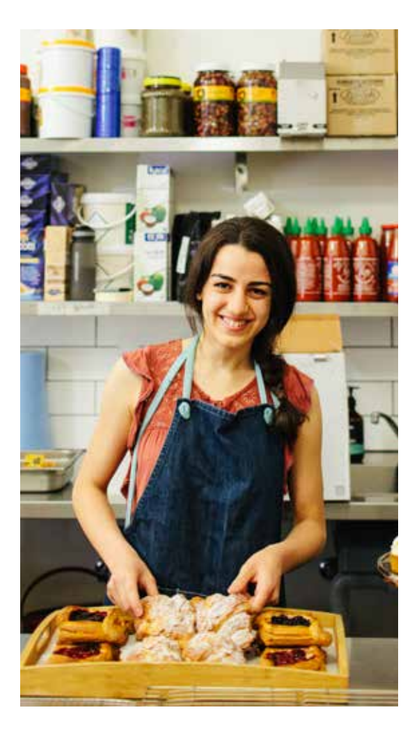
Kinfolk's café business supports volunteers to gain skills and confidence

'A small, incidental spend by a government department can be game changing in terms of social outcomes."